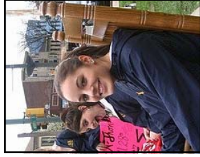
Our motto: "Once a Phi Sigma Sigma, always a Phi Sigma Sigma!"

That's because our members share a deep commitment to sisterhood, service, leadership and scholarship — values that endure long after your college years are fond memories.