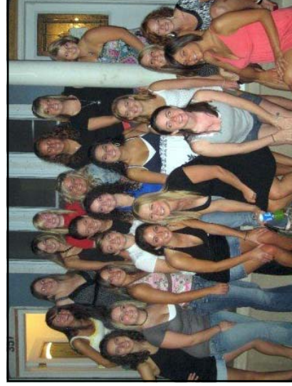
Phi Sigs are individuals who share a common bond — and remain friends long after college years are over. That's why we're in contact with more than 2/3s of all sisters since 1988!

Interested in becoming a Phi Sigma Sigma? We're always looking for outstanding young women who